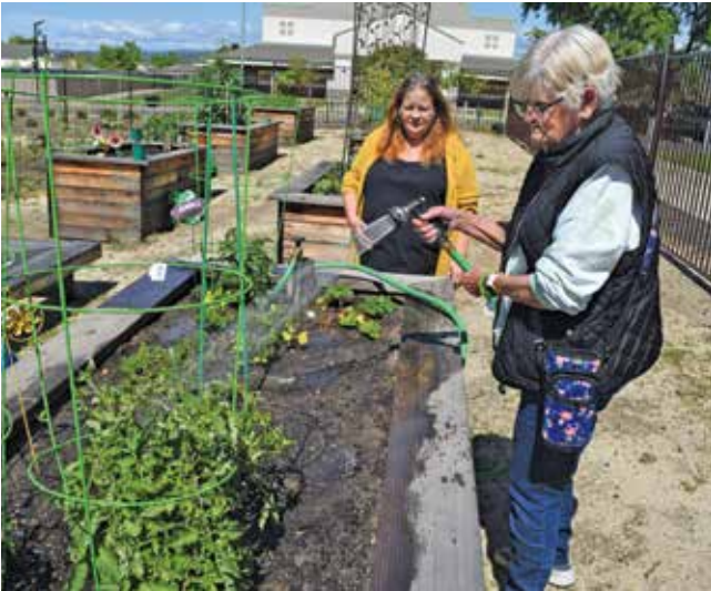
Residents tending to the James W. Jessee ‘Jim’ Jessee Community Garden