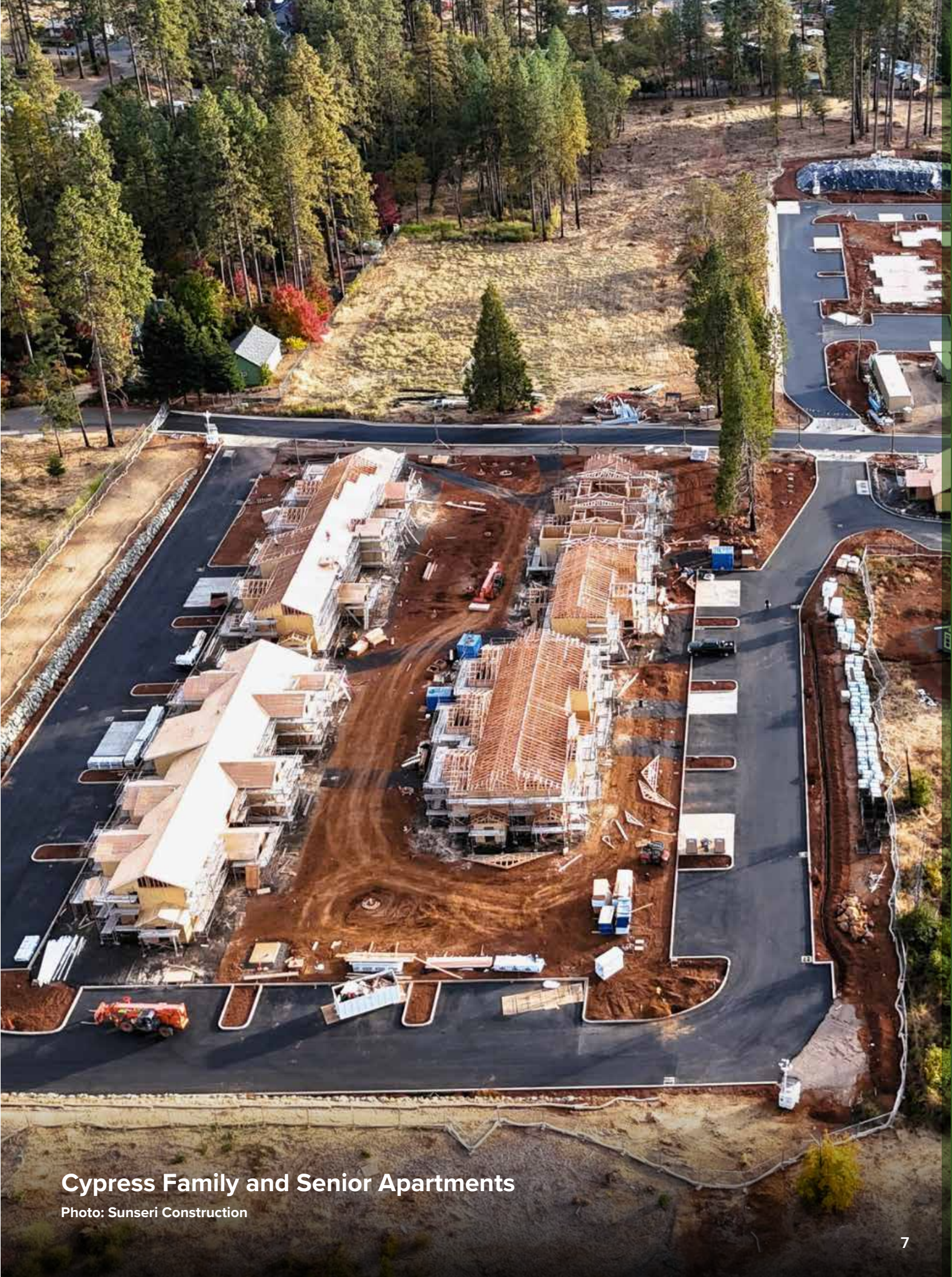
Cypress Family and Senior Apartments